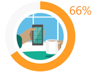
of employees use personal devices for work purposes.*

While mobile CRM has traditionally been addressed by outfitting users with laptops, today’s mobile CRM extends the computing environment even further to the latest in mobile devices that optimally integrate voice, e-mail, and other data services in a hand-held form factor.