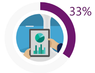
of employees that typically work on employer premises, also frequently work away from their desks.***